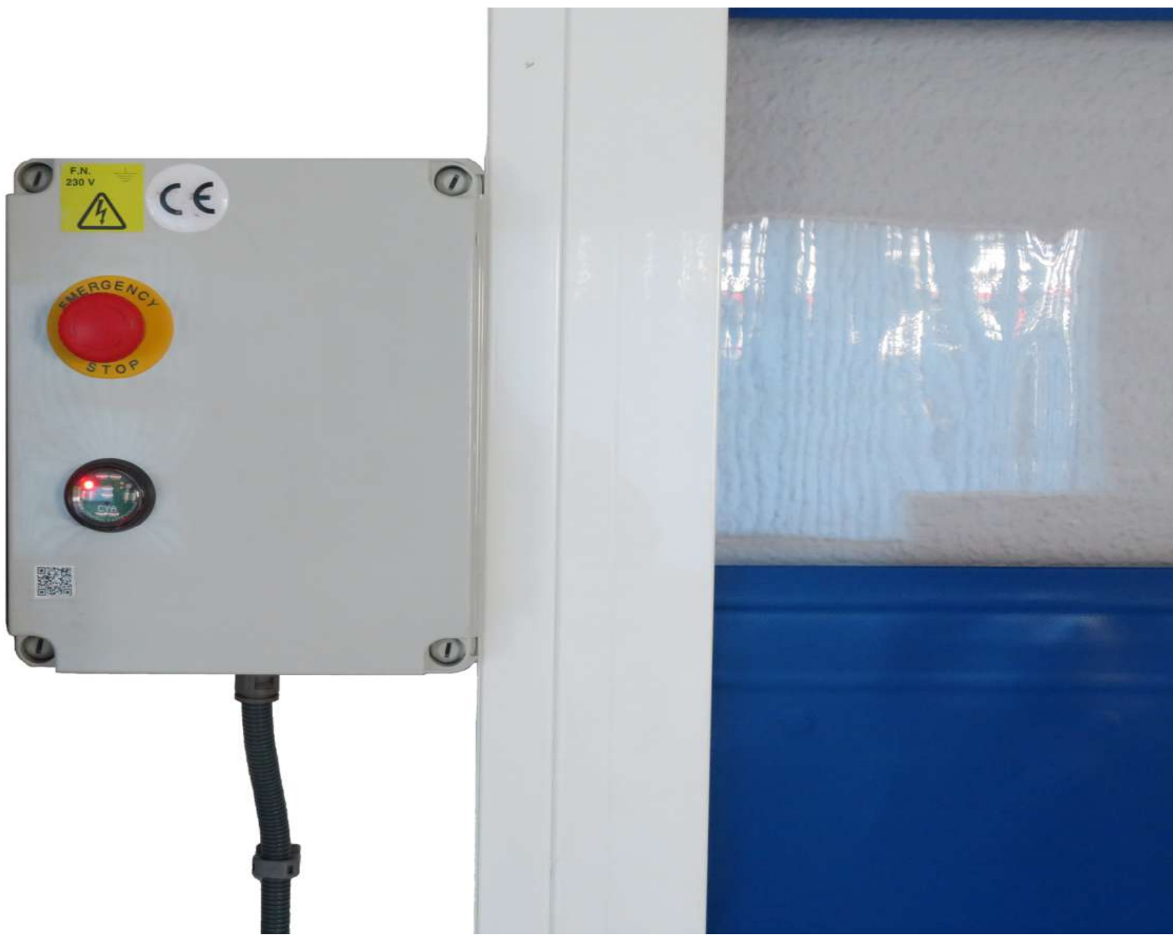
Opening sensor. No need to touch a button